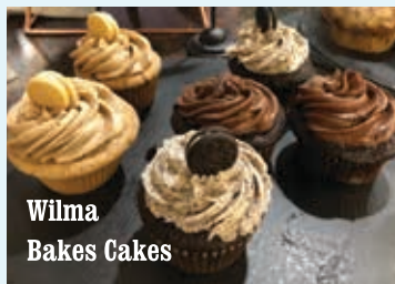
Wilma Bakes Cakes