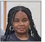
Juneteenth awards, p.7