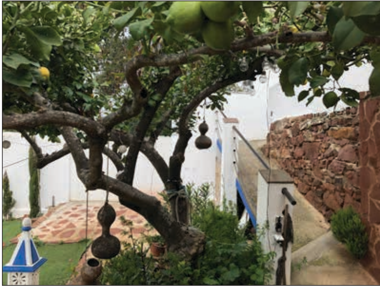
A shady terrace, one of five levels on the slope, sports lemons.

One highlight was a visit to an Agriturismo near Bensafrim. The host was the fourth generation of the family to make it her home, and was lured back to the