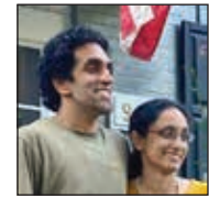
Wedding congratulations, p.4