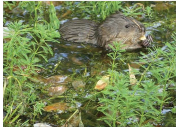
Muskrat at Greenbelt Lake in the peninsula forebay