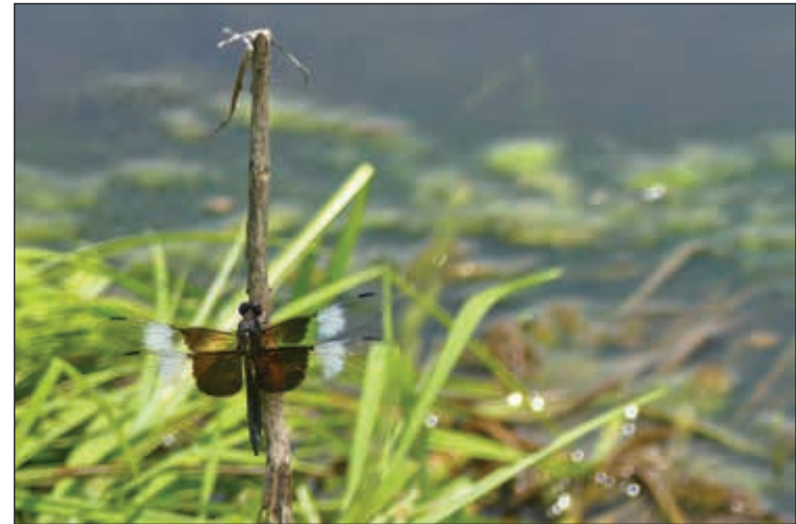
A dragonfly has markings that look like sunglasses.