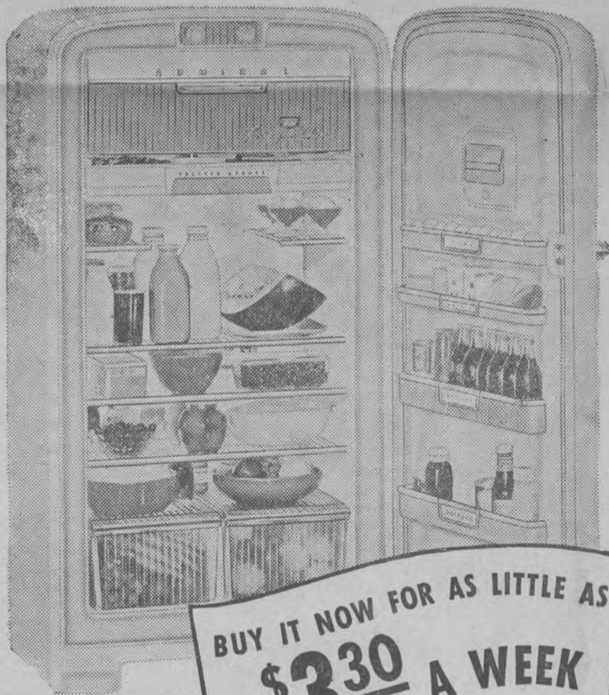
ADMIRAL MODEL 11C7