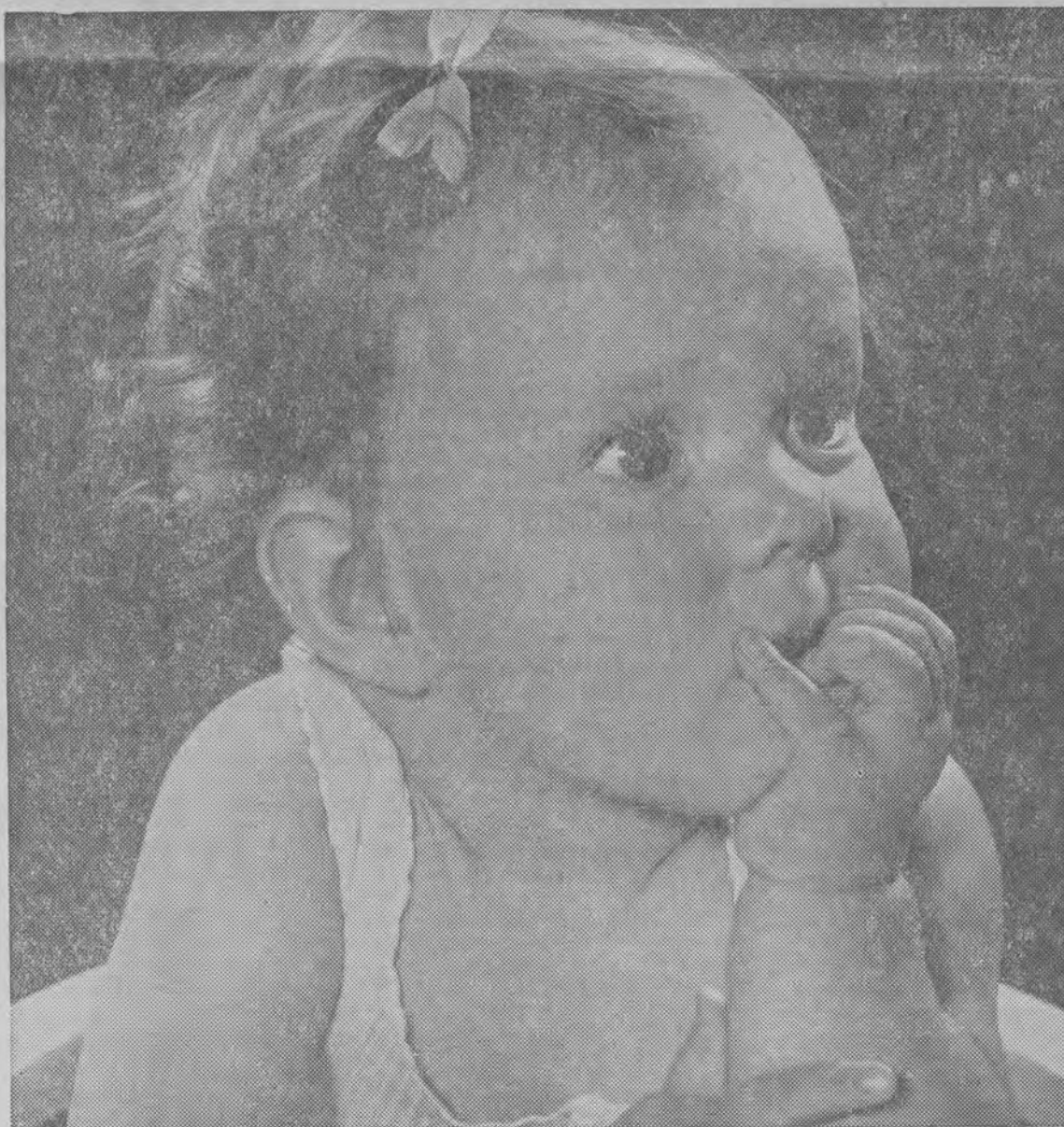
"Won't he ever call?"

Stop biting your nails, your boy friend may be trying to get you now! Of course, if someone forgot to replace the receiver after a call, your telephone and all others on the party line are out of service. When you hang up after each call, be sure that your receiver is not caught on a book or other object. A little care pays off in better service for you and your party-line neighbors. The Chesapeake & Potomac Telephone Company.