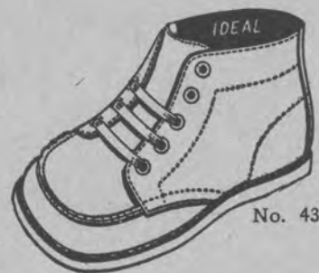
White Elk, Moccasin Toe, Flexible hard sole Walking Shoe, sizes 3 to 8 for average foot. The same shoe in wide width No. 532.

Every pair must pass Ideal's rigid tests of construction and quality. That's why doctors have been recommending these superior baby shoes for half a century.