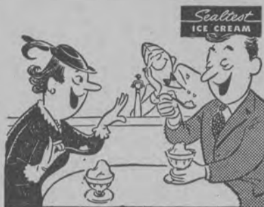
Be smart! Let Sealtest save the day!

Anytime, enjoy Sealtest Ice Cream! Try "REAL PINEAPPLE," Flavor-of-the-Month for August.