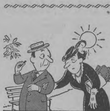
Summer's Heat Drive Pep Away?

LOST—A pair of pink shell-rimmed "Harlequin" glasses in vicinity of Center or Drug Store or way to 13-L Ridge. Finder contact Gr. 3766.