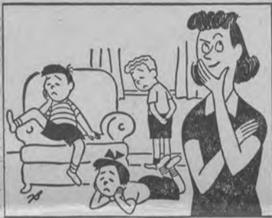
When children wilt, Too hot for play