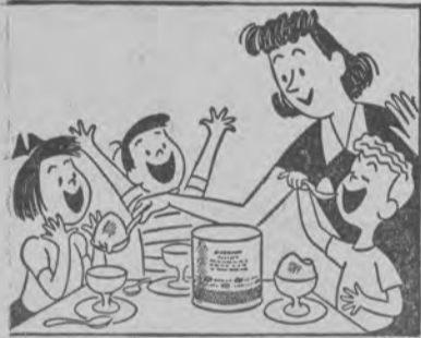
Be smart! Let Sealtest save the day!

Anytime is Sealtest time! Remember, too, Old-Fashioned Coconut Ice Cream, the Flavor-Of-The-Month for June.