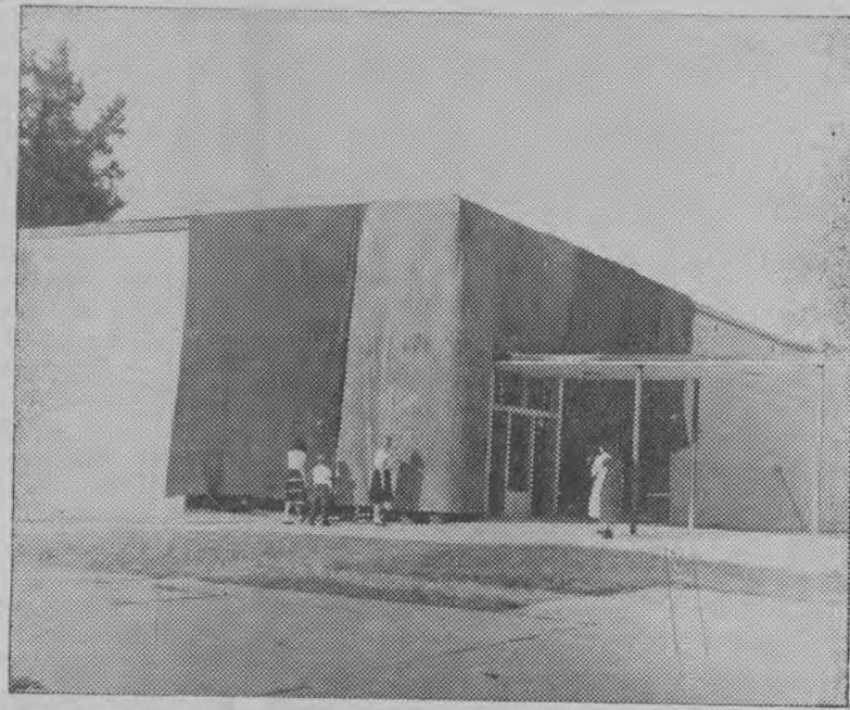
CURTAIN GOING UP! New GCS building as of last Saturday before the windows were put in.

Elementary school children will have a two-day vacation on Thursday and Friday, October 7 and 8, to permit teachers to attend the Maryland State Teachers Convention.