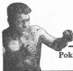
Pokes & Jabs