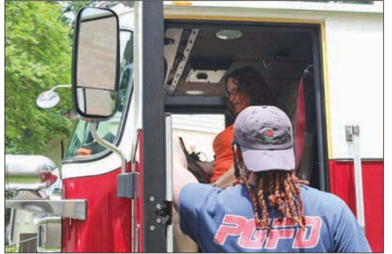
Greenbelt Fire Department opens up Engine 35 for tours.