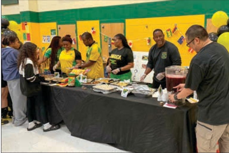
A table of Jamaican food at GMS International Day

There were dance performances by the students that brought rousing applause and enthusiasm. The joy and happiness were contagious, and everyone appeared to have a wonderful time at the International Day celebration.