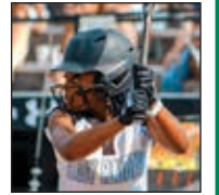
Sports, pp.12, 13, & 15