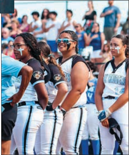
ERHS softball team members stand for the Pledge of Allegiance.