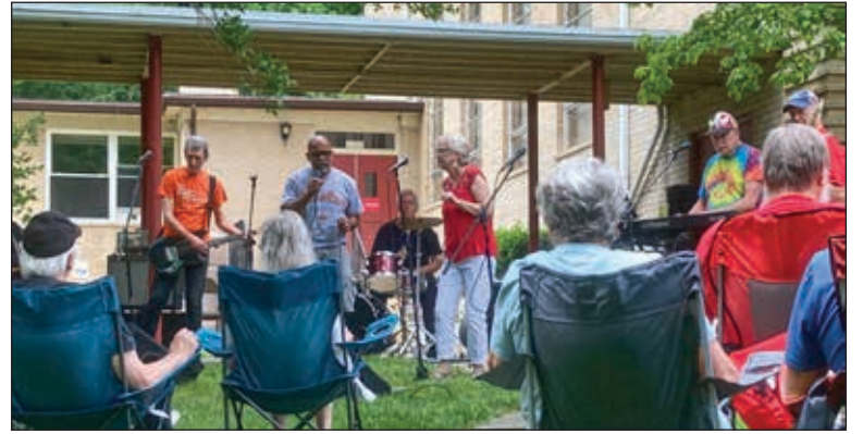
Greenbelt Community Church's rock and soul band, The Relics, sing oldies in the shade.

Greenbelt Community Church Family Day featured music, games, a firetruck and perfect weather. More than 50 people showed up to enjoy the afternoon on the lawn on Sunday, June 9.