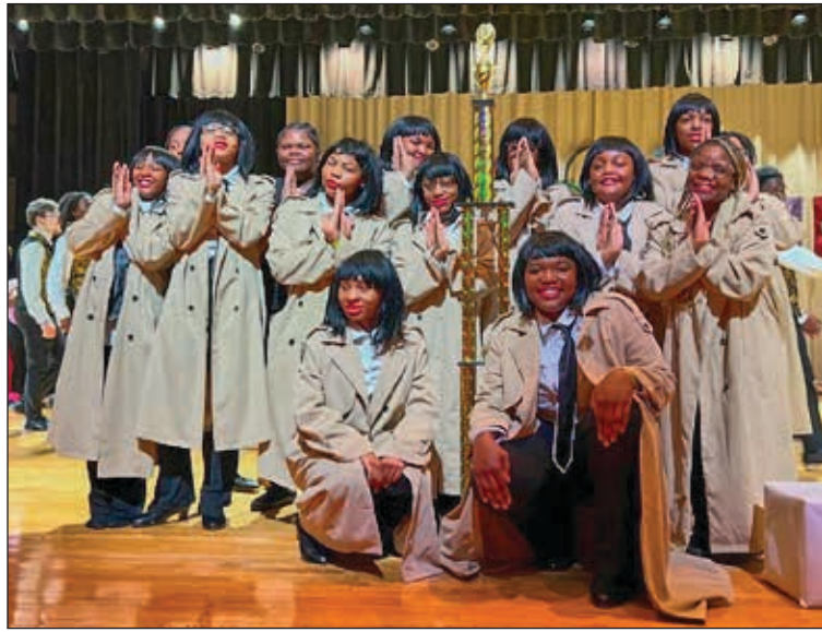
Lethal Ladies, the winning step team from Baltimore, pose with their trophy at the tournament.