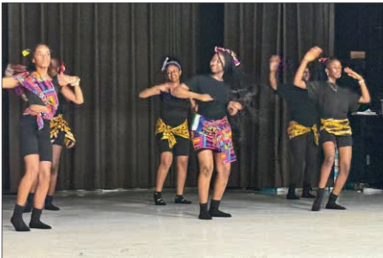
GMS International Day dance performance