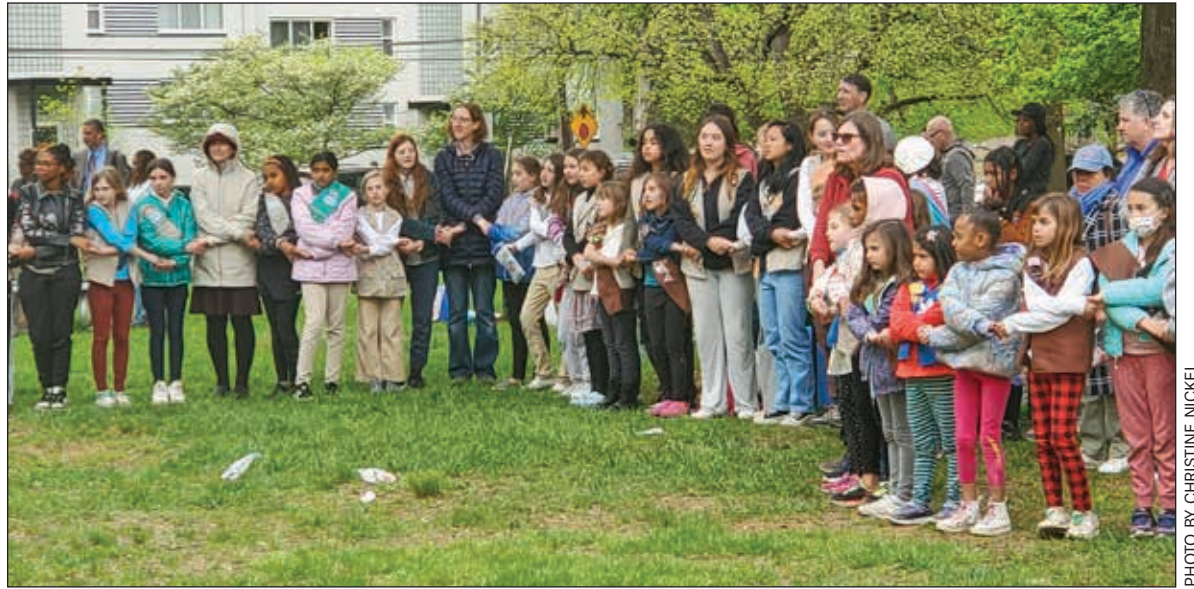
Girl Scouts join together on the Community Center lawn for World Thinking Day.