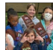
Girl Scouts, p.16