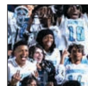
ERHS lacrosse, p.15