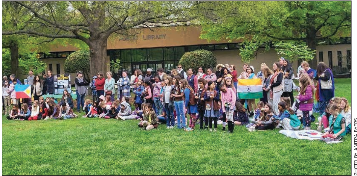
A large crowd of girl scouts gathers outside Greenbelt Library on World Thinking Day.