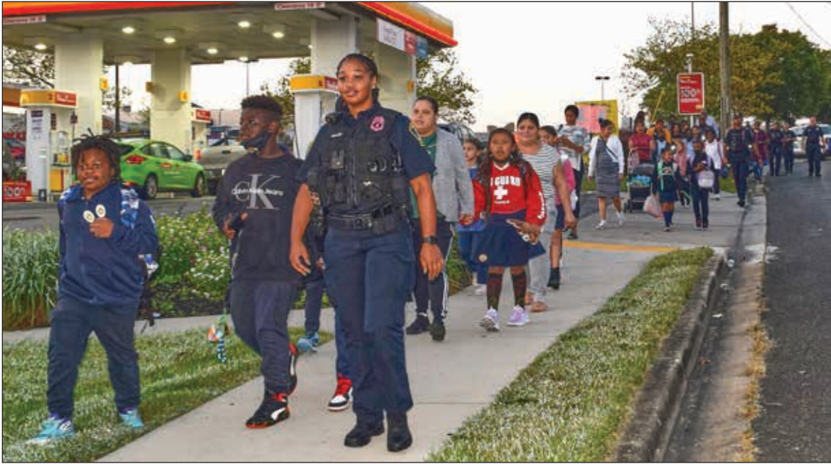
Springhill Lake Elementary students walk to school on October 4, escorted by Greenbelt police.

At 7 a.m. on Wednesday, October 4, a couple of dozen children and parents, along with Greenbelt police officers and members of the Greenbelt City Council, gathered in the parking area near the back of Beltway Plaza to walk to school. Walk to School Day takes place in over 40 countries on the first Wednesday of October and has taken place annually for over 25 years. It's part of a movement promoting walkable communities and safe routes to school.