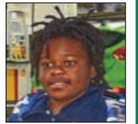
Walk to School Day, p.7