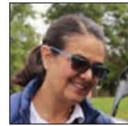
Electric Vehicle Show, p.13