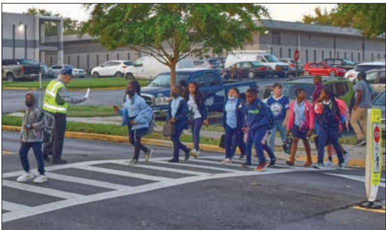
A crossing guard greets students walking to Springhill Lake Elementary.