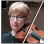
Philharmonic concert, p.6