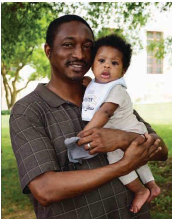
A father holds his daughter at the Teddy Bear picnic.