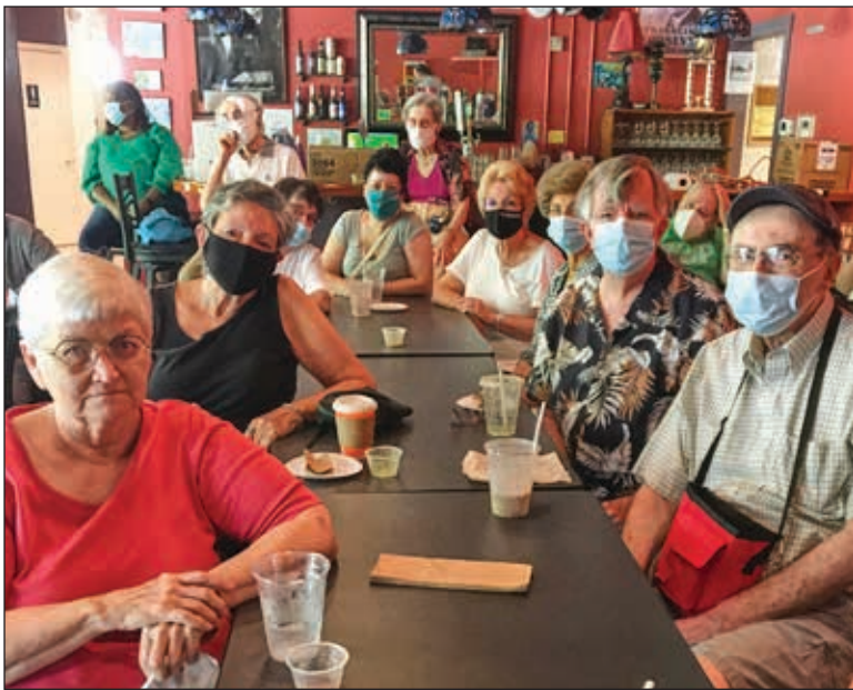
Golden Age Club members enjoy smoothies and other beverages at the New Deal Café.