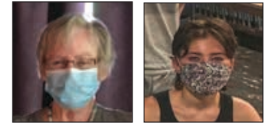
Golden Age Club at Café, p.7