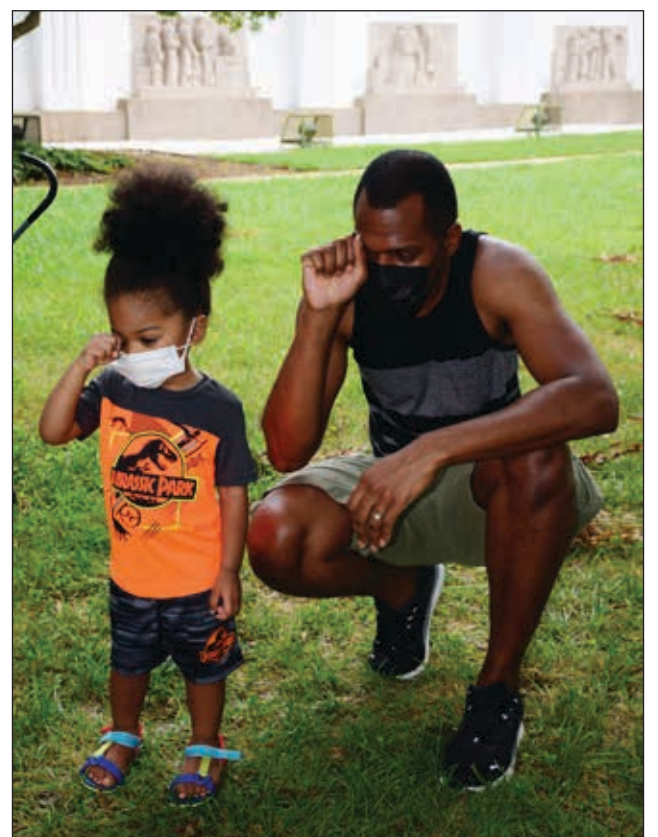
A father and daughter actively participate in the singing at the Library event.