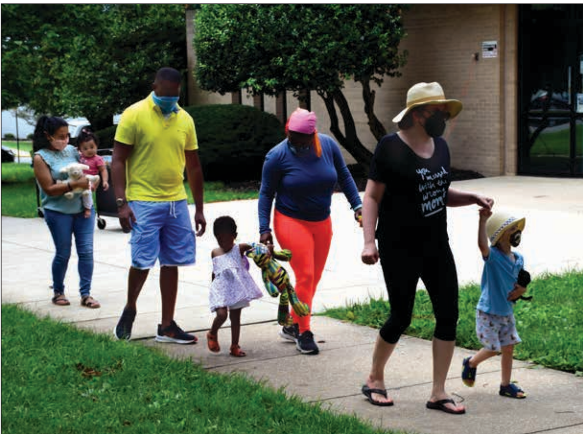
At the end of the songs and storytelling and to the accompaniment of recorded march music, parents and children march in a parade.