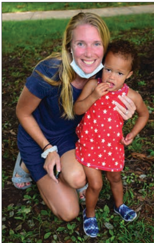
A mother and daughter attend the event. The daughter isn't entirely convinced about it.