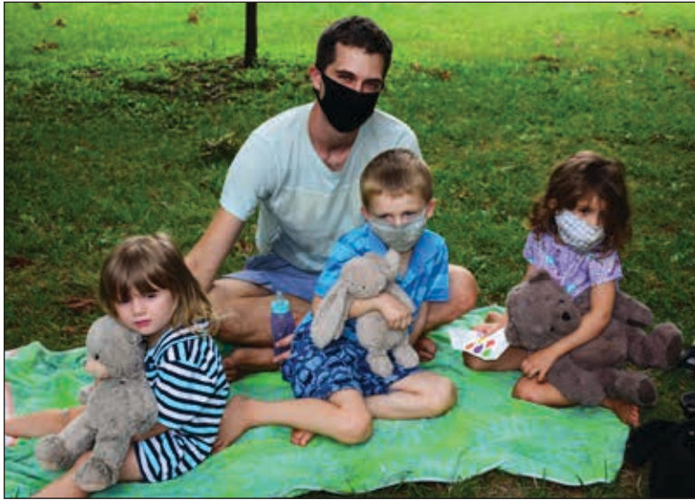
A father and his three children are accompanied by two teddy bears and a rabbit at the Teddy Bear picnic at the Library on August 14.

The event also included songs, a craft where children decorated a paper cupcake for their stuffed animals, a parade, small packages of Teddy Grahams (graham crackers) and pre-packaged drinks for the children. The event was paid for by the Friends of the Greenbelt Library.