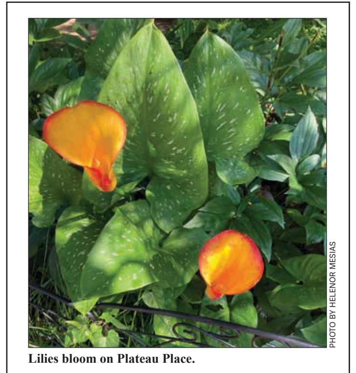
Lilies bloom on Plateau Place.

One need not walk alone during Covid-19; GCC and many other faith communities are providing opportunities for sharing, prayer, meditation and Bible study. GCC has Sharing and Bible studies events available on Zoom. For more information check the Church Calendar and Events at the bottom of each page.