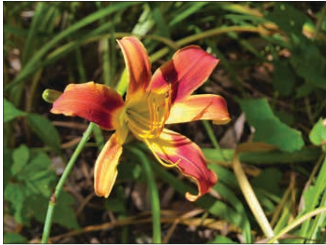
A flower looking pretty at Schrom Hills Park

The DSP will next be presented on Thursday, September 9 at a hearing of the Prince George's County Planning Board.