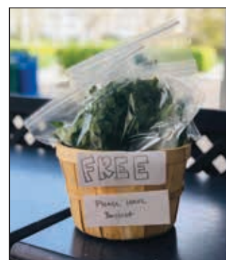
Baskets of produce are left outside the New Deal Café on Tuesday, March 31 for those who want or need it.