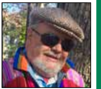
Time Bank, p.11