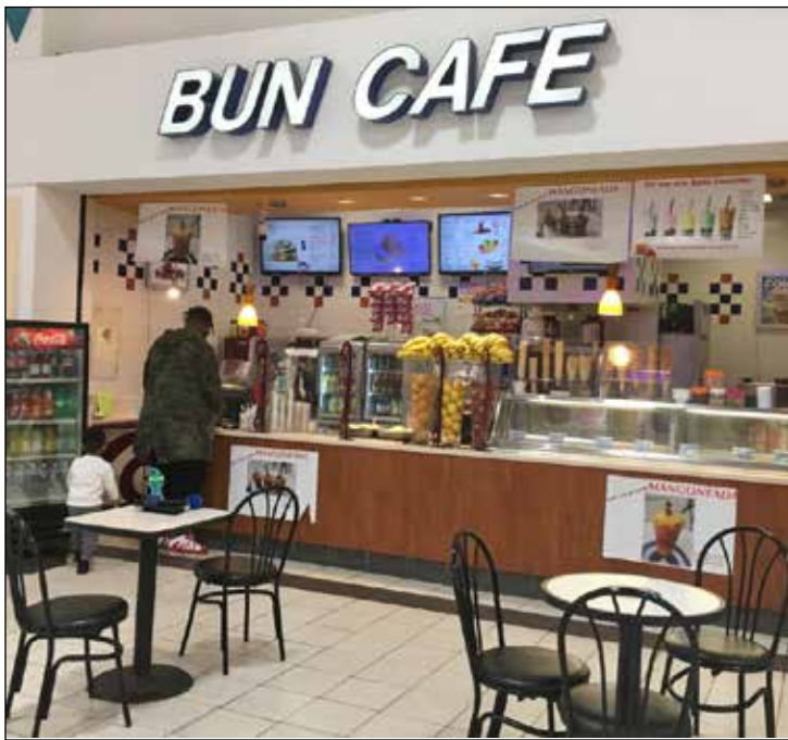
Bun Cafe in Beltway Plaza

The Bun Cafe is located inside the mall across from TJ Maxx. Business hours are: Monday through Saturday from 10 a.m. to 9 p.m., Sunday from noon to 6 p.m.