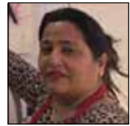
Bun Cafe, p.8