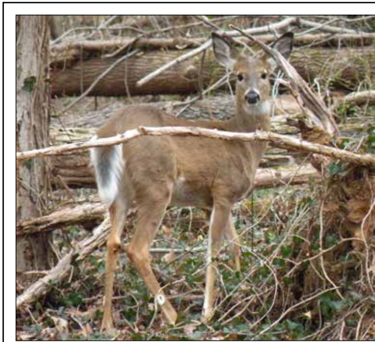
A deer pays attention to a passing photographer while feeding during the afternoon in the woods near the former St. Hugh's School.

GCF's mission is to support worthwhile initiatives by local organizations benefiting the Greenbelt community. GCF has two grant cycles a year; grant awards range from $500 to $5,000 and are given to Greenbelt community groups, cooperatives and nonprofit organizations. Interested groups may next apply for a grant on April 15 for new or existing projects.