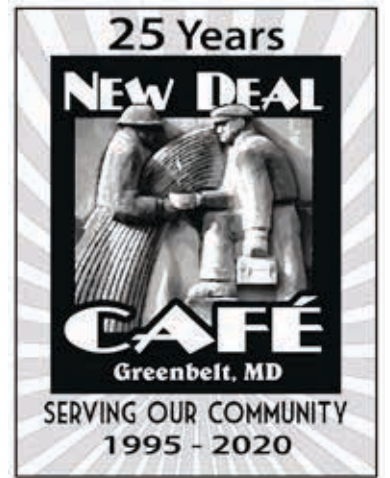
New Deal Café 25 Year Logo

From its founding, the New Deal Café has been a member-owned, volunteer-run, not-for-