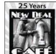
25 Years of New Deal Café, p.7