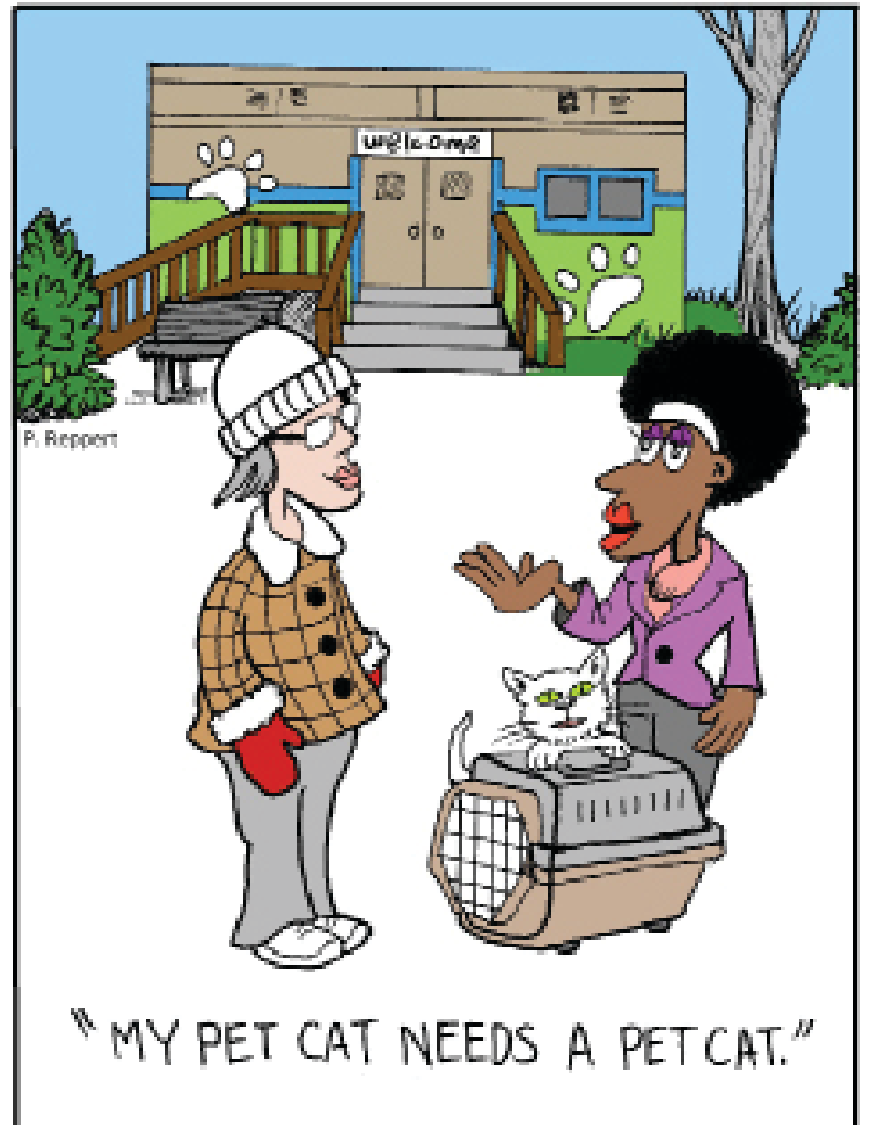
- Greenbelt News Review, February 11, 2016

OC = Open Captions CC = Closed Captions DVS = Descriptive Video Service