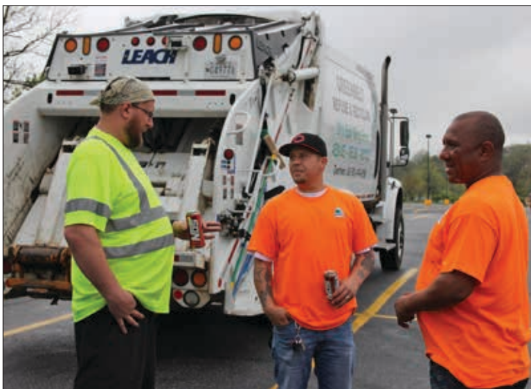
Greenbelt public works staff wait to receive the trash.