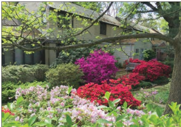
Azaleas bloom in GHI.

Greenbelt Community Center at 15 Crescent Rd. OFFICE HOURS: Monday 2 - 4 p.m., Tuesday 2 - 4, 6 -10 p.m.