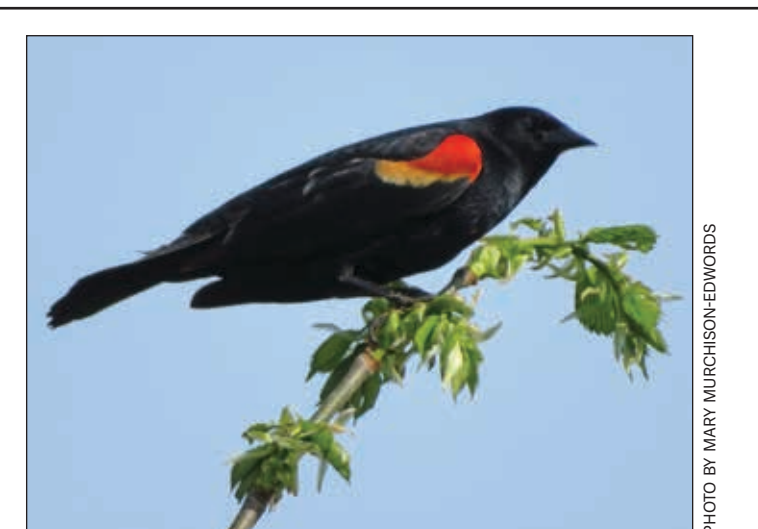
A Red Winged Blackbird hangs out at the pond across from the Greenbelt Post Office.

Management objectives for FY20 include working with the Economic Development Coordinator to improve the business area of the website and promote businesses, increasing the number and types of informational newsletters sent out using GovDelivery, streamlining the cablecasting and streaming of off-site city council meetings and increasing social media use. GovDelivery is the system allowing residents to subscribe to various newsletters and other information.