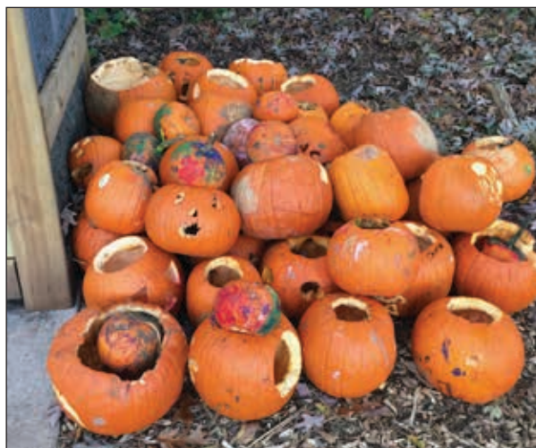
Pumpkins from the Halloween Pumpkin Walk await their return to earth.