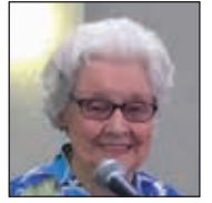
Golden Age Club Luncheon, p.16