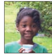
Hot composting, p.10