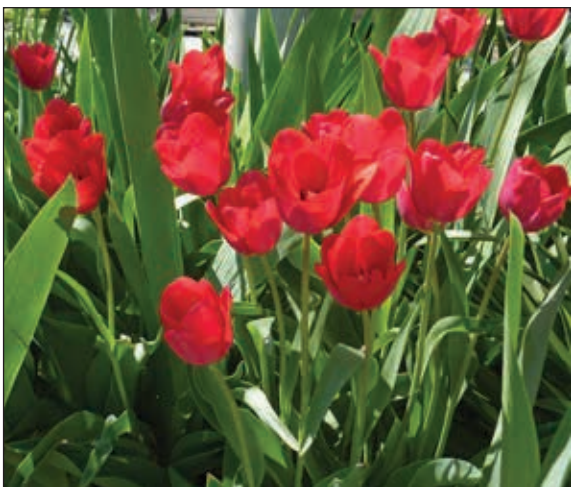
Tulips are blooming in Greenbelt.