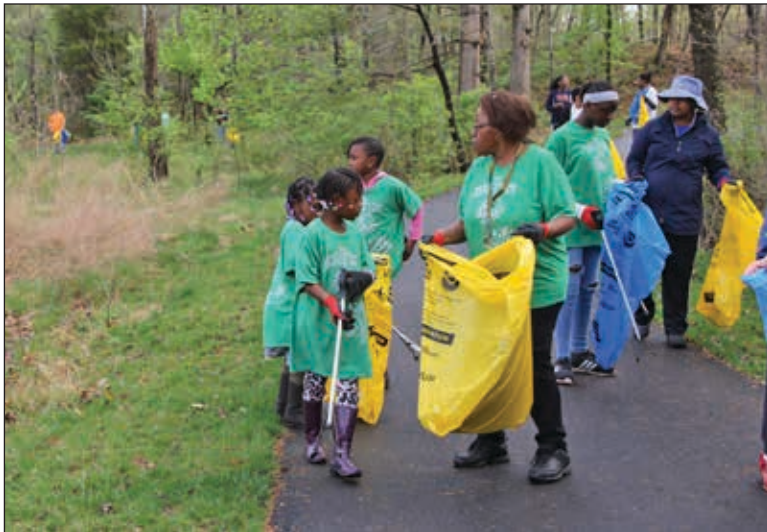
Greenbelt community members clean up trash along the Indian Creek trail.