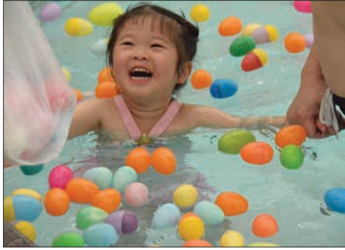
Children enjoy the underwater egg hunt at the Aquatic & Fitness Center.