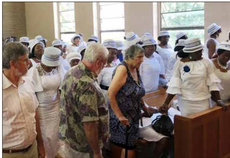
Members of the Harford Old Girls Association, in blue and white hats, visit Greenbelt Community Church United Church of Christ.

Close to 50 members of the Harford Old Girls Association USA and their families visited and worshiped with the Greenbelt Community Church United Church of Christ on Sunday, July 16. The association is comprised of alumnae from The Harford School in the Southern Province of Sierra Leone, Africa. The school was formed by the Women's Missionary Association of the United Brethren Church Mission in 1877. The land and buildings were dedicated in 1900.