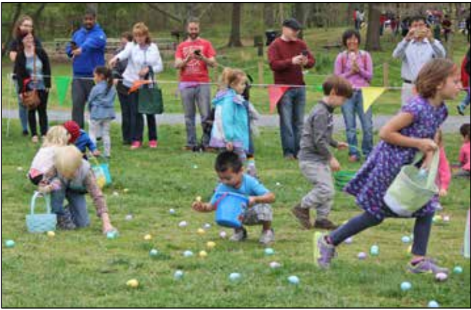
Kids gather the eggs at the Easter Egg Hunt at Buddy Attick Park on Saturday.

At the indoor pool, kids scrambled around the shallow end scooping empty eggs into their baskets as fast as they could.