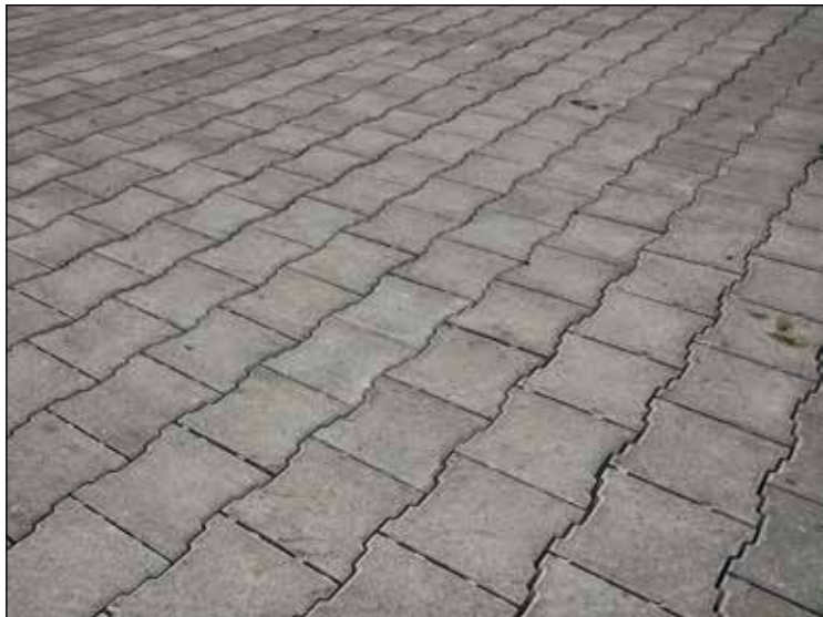
Close up of permeable parking lot at Springhill Lake Recreation Center

Another way to alleviate stormwater runoff is by removing impervious surfaces like underutilized sections of driveway or patio and replacing these areas with native vegetation. However, for those who already use the