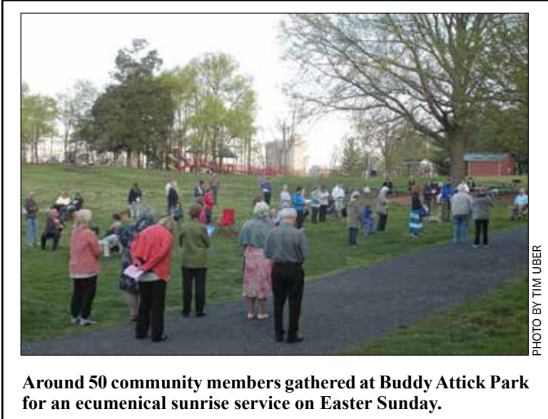
Around 50 community members gathered at Buddy Attick Park for an ecumenical sunrise service on Easter Sunday.