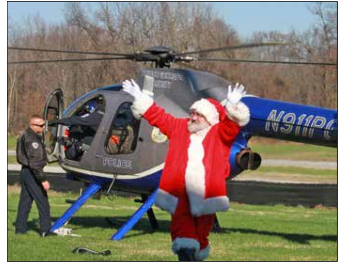
Santa walks away from his helicopter sleigh at the College Park Airport.

The museum shop is open for holiday shopping from 10 a.m. to 5 p.m. Call the museum at 301-864-6029 or email: aviationmuseum@pgparks.com with questions.