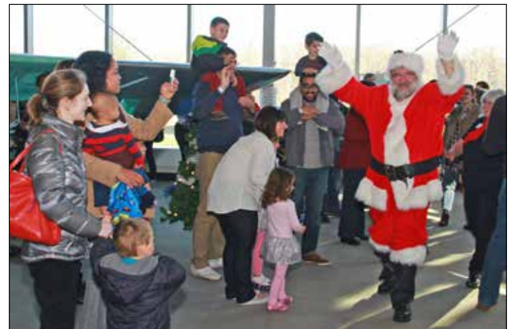
Santa greeted his guests last year at the College Park Aviation Museum.