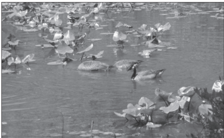
Two demi-dabblers appear headless, while the third breathes between dabbles.