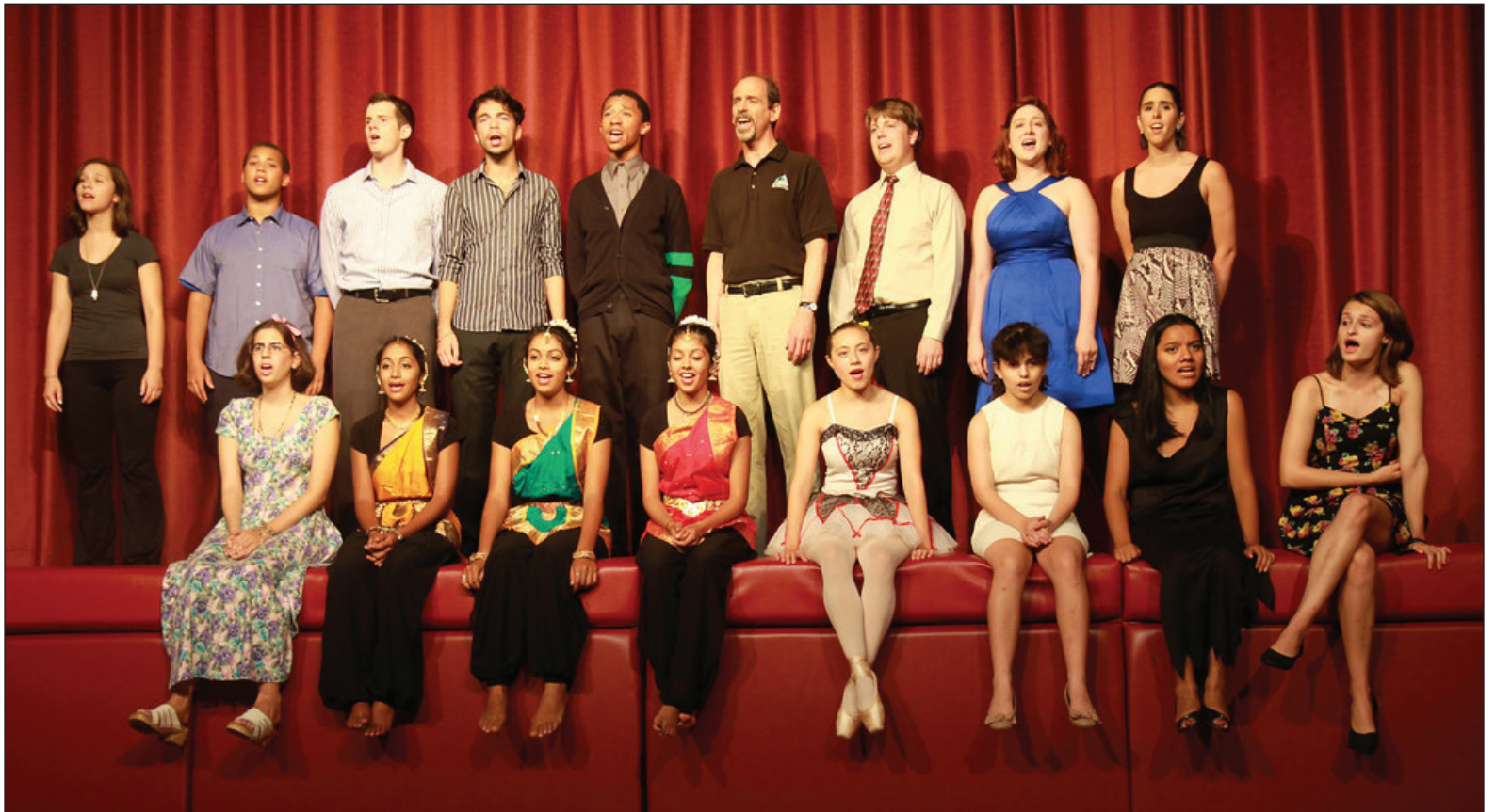
The whole cast sings "Homeward Bound" as a finale.