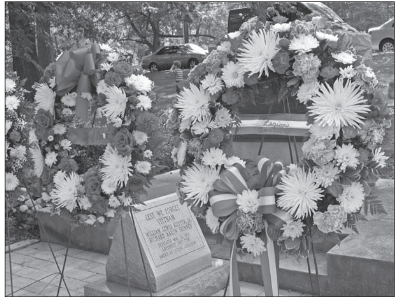
Wreaths were laid at the Roosevelt Center War Memorial as part of Greenbelt's Memorial Day commemoration.