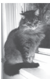
In Loving Memory Pumpkin 6 Fayette Place (Formerly 2-C Northway) Born May 1992 Died March 23, 2005