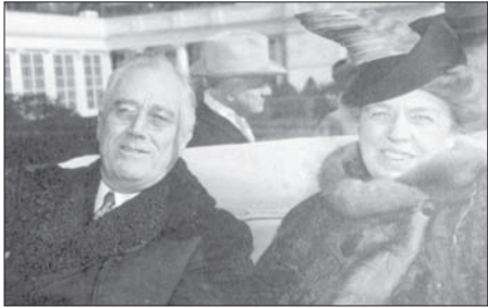
President Franklin and First Lady Eleanor Roosevelt pose in their open car in front of the White House.

On Tuesday, April 12 at 7:30 p.m., the Greenbelt Museum, The History Channel and Comcast will host a free preview screening of the History Channel documentary "FDR: A Presidency Revealed" at the Greenbelt Theater. This 85-minute sneak preview will feature rare footage, photographs and oral histories from private collections that reveal the private side of