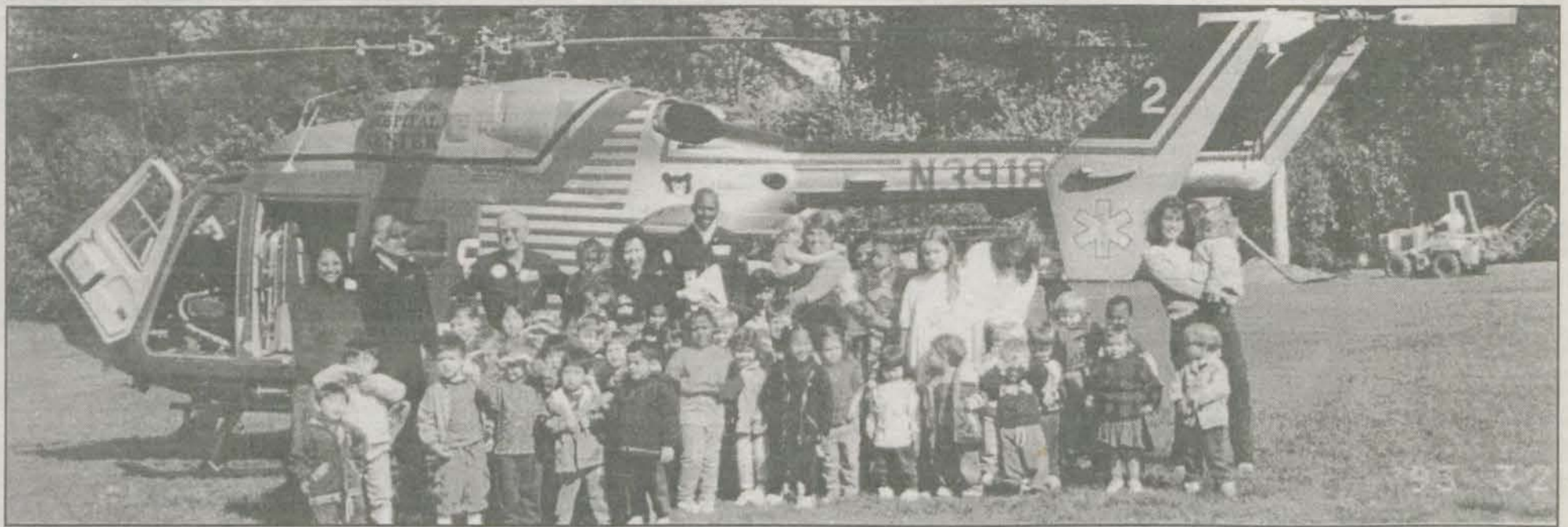
Members of the MedSTAR flight team are joined by Greenbelt Nursery School students, staff, and parents behind the Greenbelt Youth Center on October 20.