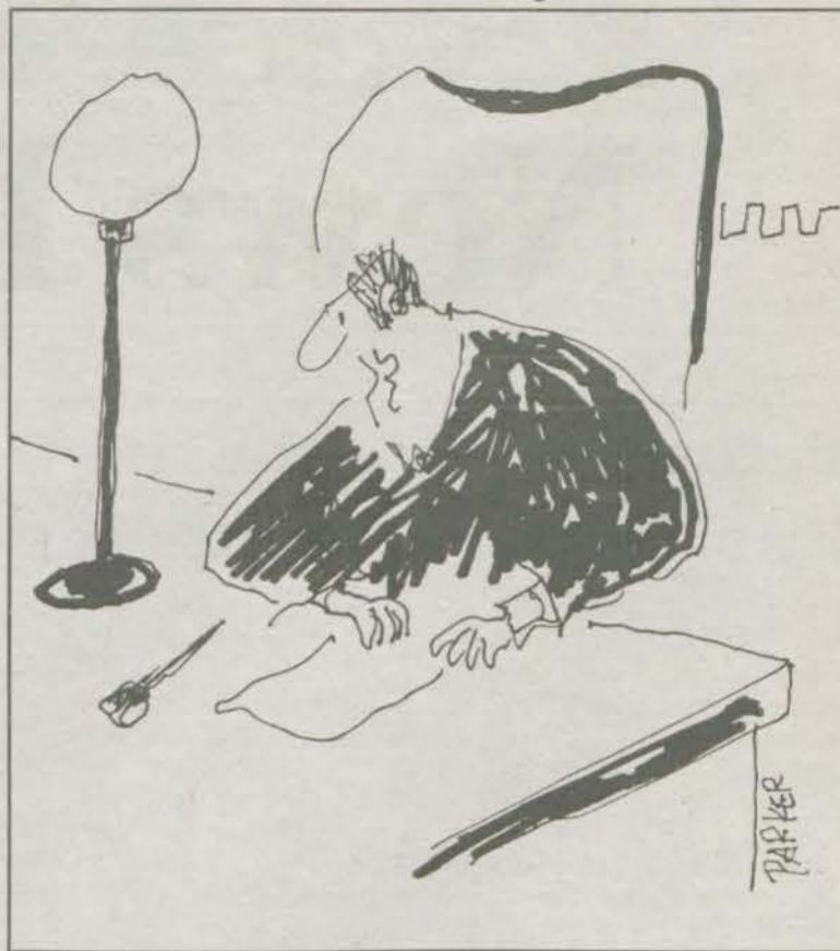
"I sentence you to four years of the U.S. Presidency...!"