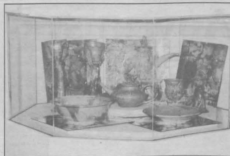
A composition of the artist's work.

"Pulling the Rabbit Out of the Hat" at the Parents Association Gallery is located on the first floor of the Stamp Student Building at the University of Maryland. The exhibit has been extended through Friday, July 28.