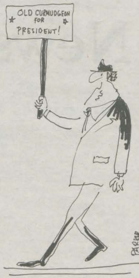
"Nader has the Greens Party. I have the Black and Blues."

The Friends of the Greenbelt Museum Present