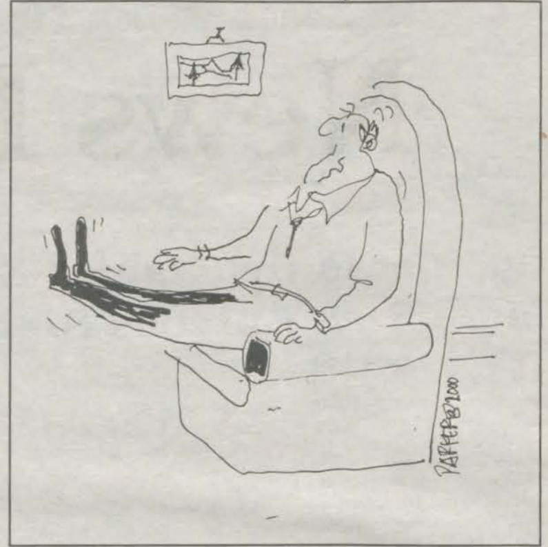
"Oops! I think I found that Easter egg I lost!"