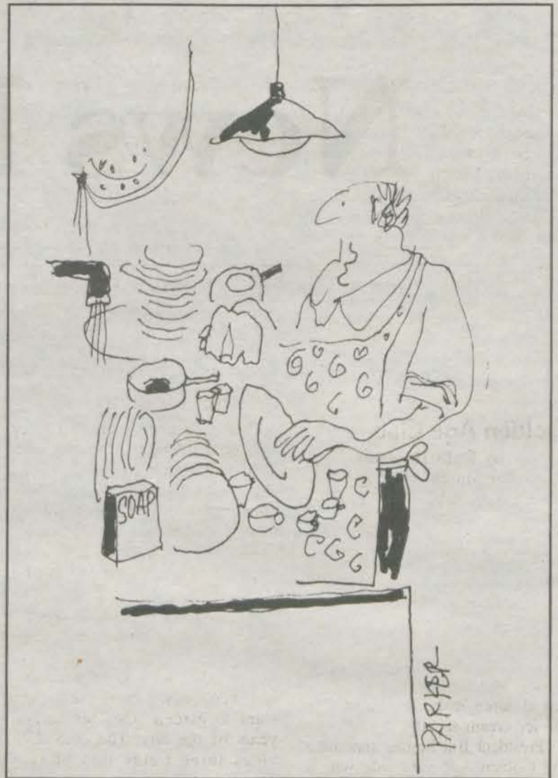
"I'll never bet on a primary election again!"