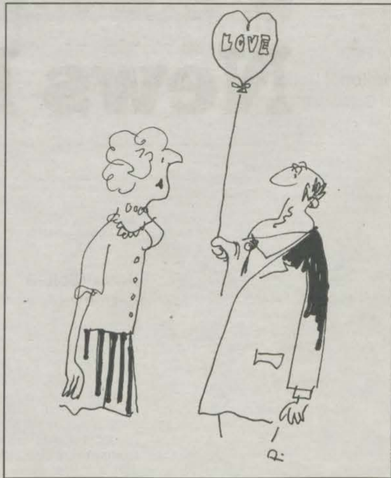
"I forgot to put a love note in the News Review!"