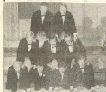
Elegant Wedding Photography and Video in the Belle Point Office Park