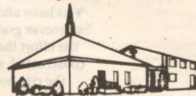
Counseling Service Available 301/681-3201

Sunday Worship 11 a.m. Children's Education 10 a.m.