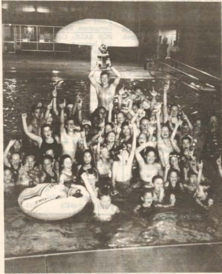
Greenbelt Barracudas celebrate their Division C Championship in the Prince-Mont League and proudly display their championship trophy at the Greenbelt swimming pool.