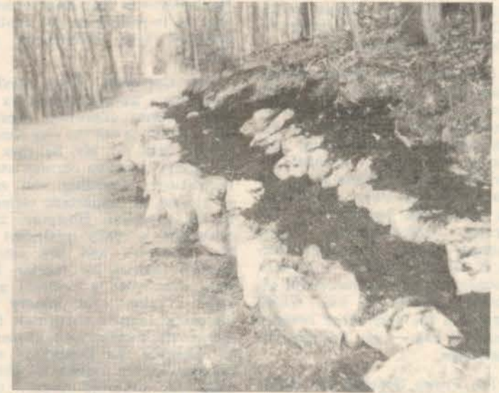
Rocks have been placed alongside a portion of the Greenbelt Lake path in order to curtail erosion from the embankment. The soil added between the rocks will be stabilized by the planting of native wild flowers.