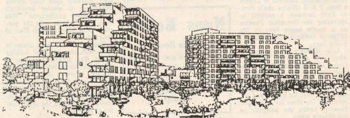
Above is a 1988 architect's rendering of the Sunrise Village apartments which are planned for a site southeast of the Holiday

People will be given a receipt to use for income tax deductions.