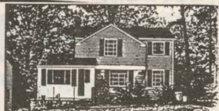
CHEVERLY PROPER: LOW LOW PRICE - Don't wait! this one won't last. Two added on dens, fireplace in Liv Room, big back yard. $112,750 Call now.