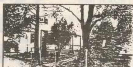
RIVERDALE PARK: Stone & vinyl, lovely 3 bedroom home just painted and vacant. Call now - move in 45 days. $95,500 Nice hardwood floors. Call 345-2151