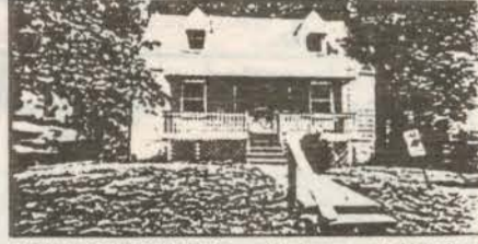
REAL DOLL HOUSE: Completely renovated four bedrooms, 1 1/2 baths, new kitchen, new rec room, new w/w carpet and den on rear, bargain basement price $114,000

APARTMENT DWELLERS. There will never be a better time to buy a house. Interest rates are at a 20-year low, ranging from 5 1/2 to 8%. We have good, well-located homes throughout the county at bargain prices. Several are vacant, renovated, ready for quick occupancy. Call us or drop in — you'll be glad you did.