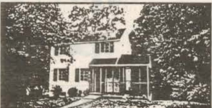
CHEVERLY PROPER - ALL BRICK: Three Bedrooms 1.5 baths, fireplace, rec-room and w/w carpet. Near metro. Priced to sell real fast at $117,500. all terms, call 345-2151.