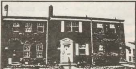
GREENBELT - CHARLESTON VILLAGE: $93,600. Truly a bargain for this Three bedrm, one full and two half baths, walk to tennis lake and playgrounds. Great Location.