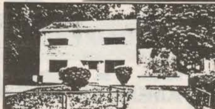
DOLL HOUSE - ALL FIXED UP: $95,500 - Low price for 3 BR, 2 full baths, new w/w carpet. No Down VA terms or 2.7% down FHA. Vacant so hurry.