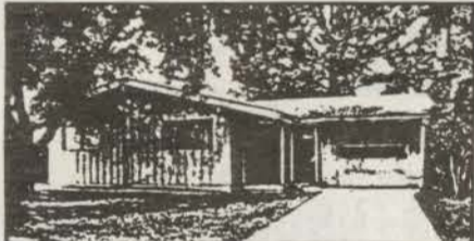
BRAND NEW ON MARKET: Three Bedrooms Two full baths and Garage. Two minute walk to shopping center and 3 minute drive to beltway. Lanham Seabrook. Only $123,750.