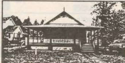
LOW-LOW PRICE: For Hyattsville Hills old fashioned neighborhood. Large U-shaped front porch. Private rear level yard & screened porch. $105,500