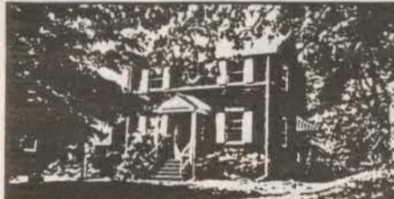
ALL BRICK COLONIAL - CHEVERLY PROPER: Three bedrooms, 1.56 baths, rec-room with Bar, fireplace in liv-rm and cent. a/c. added on den. $132,900. All terms. Call 345-2151.