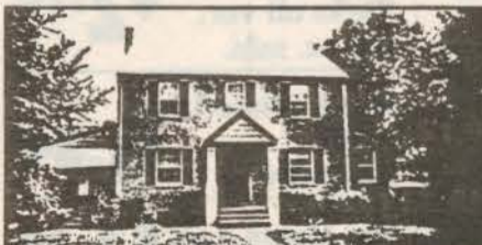
TWO PLUS GARAGE - BEAUTIFUL AND LARGE: Five bedrooms, 2.5 baths, formal din-rm, cent. a/c. w/w carpet, sun-deck and much much more. All for only $159,500. Call 345-2151.