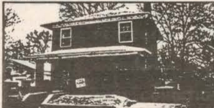
HUGE ALL BRICK HOME: Four bedrooms, 1.5 baths, rec-room, fireplace, cent. a/c. and large added on family room. Great price at $119,500. Vacant move in 35 days. 345-2151.