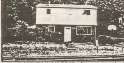
LARGE ADDITION ON REAR: Offering three bedrooms and big family room. Just painted thru-out and new w/w carpet. Excellent location. $109,750 345-2151