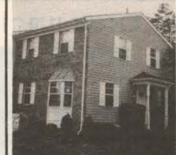
Greenbelt/Woodstream - End unit with side entrance. Fenced yard, new carpet, custom drapes, pool and tennis privileges. $129,900.

CALL ANN LAWTON LAWTON REALTY 577-4032 or Pager 513-3500