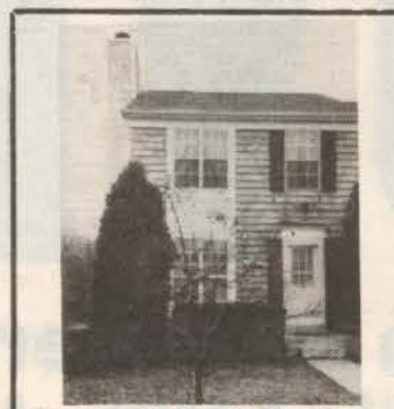
Bowie - End unit townhouse. Four bedrooms, two full baths, fireplace, new carpet and tile. All for $124,900.

Businesses in Greenbelt are invited to send us their news for this page