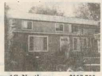
1C Northway $112,500 Brick with huge addition, 3 Bd., 2 Bath. Unbelievably nice. A must to see.