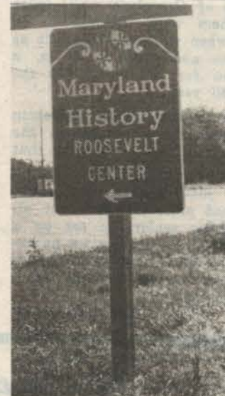
New signs on Greenbelt Road at Southway and on Kenilworth Avenue at Crescent Road aid visitors in finding Roosevelt center. ...

Each new student must be accompanied by a parent or guardian and have (1) immunization records, (2) birth certificate, (3) proof of residence, (4) transcript of report cards, and (5) recent standardized test scores.