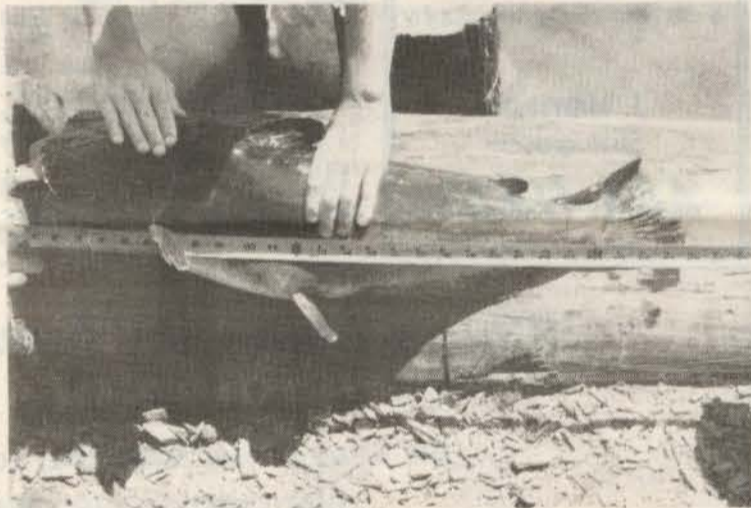
The slippery catfish is hard to measure.