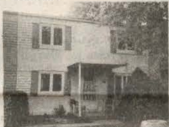
1G Southway $79,950 3 Bd, 1 Ba Block, near Center, shows beautifully, all Pella windows.