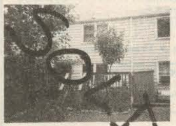
1C Plateau $89,900 2 Bd, 1 Ba, large deck, upgrad- ed kitchen & bath.