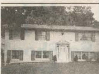
New Carrollton $149,900 4 Bd, 2 1/2 Bath corner lot Brick, mint condition.