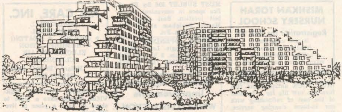
Above is a 1988 architect's rendering of the Sunrise Village apartments which are planned for a site southeast of the Holiday

2 MEDIUM CHEESE PIZZAS Plus 4 servings of diet Coke or Coca-Cola classic and NFL Quarterback Trading Cards Expires 8/25 Call us!! 474-6111 151 Centerway Rd., Greenbelt Hours: Monday-Thursday 11 am - 1 am Friday & Saturday 11 am - 2 am Sunday 11 am - 12 pm