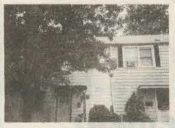
3P Research $72,950 3 Bd, 1 Ba, large addition w/ skylight, upgraded kitchen & bath.