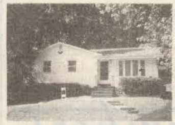
Greenbelt/Lakewood $159,900 3 Bd, 2 Ba, FP, absolutely immaculate