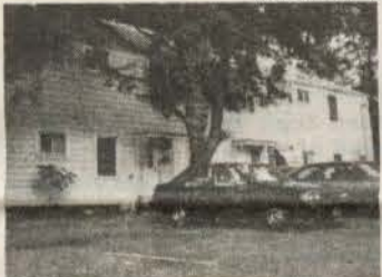
4K Plateau $59,950 3 Bd, 1 Ba, new floor and re- frig. Fenced yard, immaculate.