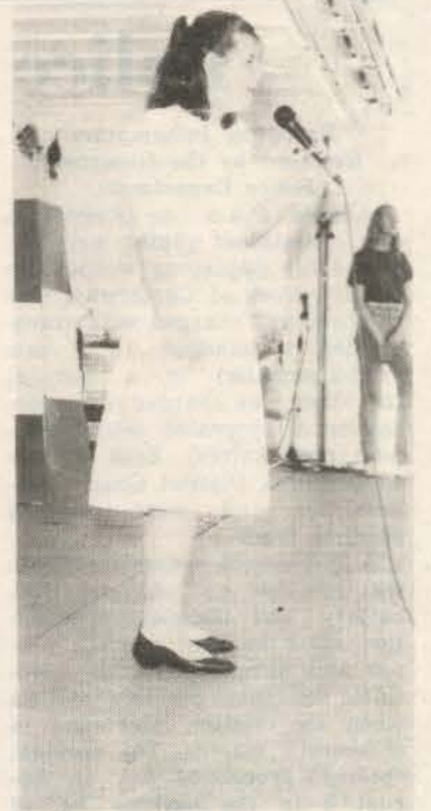
Young talent on stage at a previous Labor Day Festival.

Don't forget! Report back to the statue in Roosevelt Center for the awards ceremony.