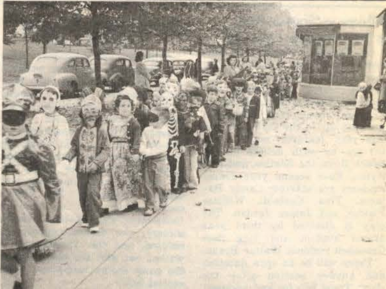
The costume themes and the cars may have changed since about 1948—and Centerway traffic may now flow the opposite direction—but Center School students parading into "The Center" (by whatever name) is still another Greenbelt tradition that has continued into the city's 50th year.