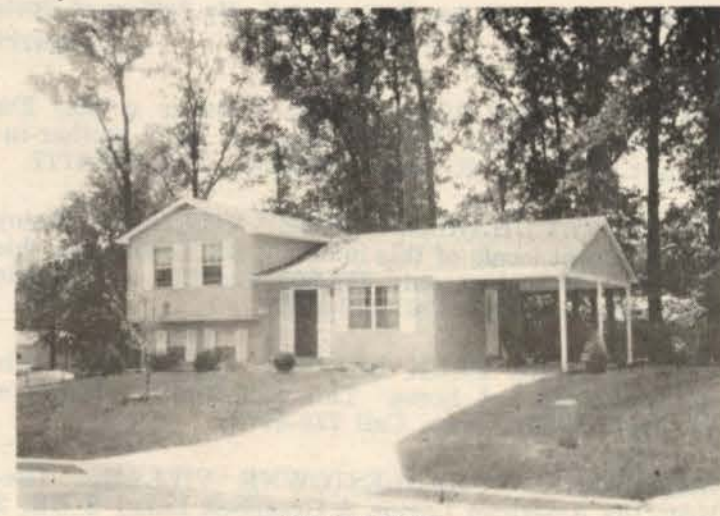
SPLIT LEVEL (From only $66,900)