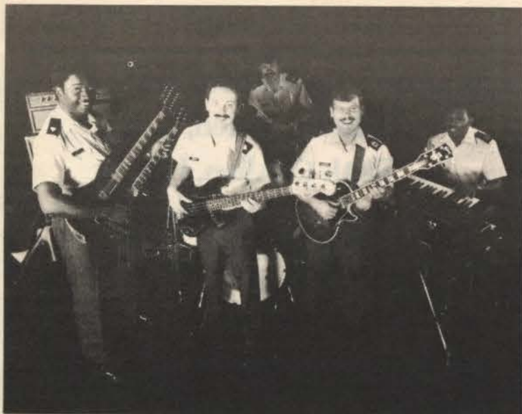
The Greenbelt Summer Performing Arts Series, sponsored by the Greenbelt Recreation Department, continue with entertainment at the "Buddy" Attick Park Bandstand this Sunday, June 19, with the U.S. Army Field Band-VOLUNTEERS at 7 p.m. The performance is open to the public free of charge. Bring a chair or blanket and enjoy.