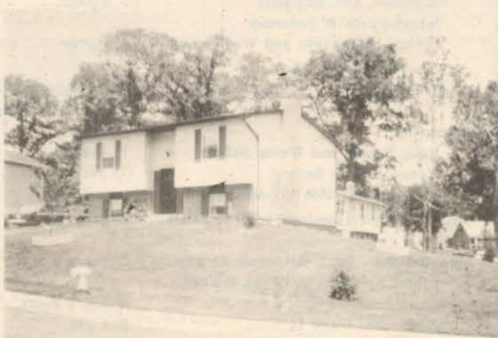
SPLIT FOYER (From only $66,900)