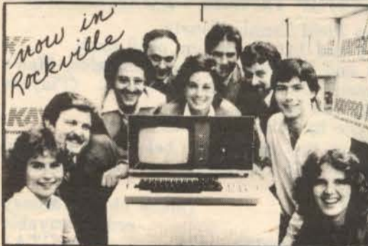
Our sales staff

5003 Greenbelt Rd. - with MD. CYCLE 345-7675