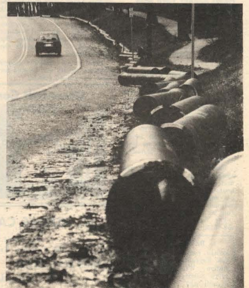
Pipes lie in patient wait along Crescent Road where they will form a new water main to be completed in approximately two weeks.

The participant bringing in the highest total contributions will have his name engraved on the Hosea D. White, Jr. Memorial Plaque displayed in the Youth Center. Those collecting $100 or more will be entered in a statewide drawing for a Casal Futuristic moped, a 13 inch color television or an Atari Video Computer Game System.