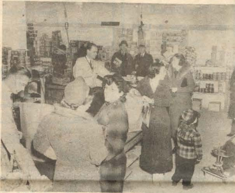
. . . The more they stay the same. Except for the hats, this picture of neighbors chatting 45 years ago in the forerunner of today's co-op store could be duplicated on any afternoon today.