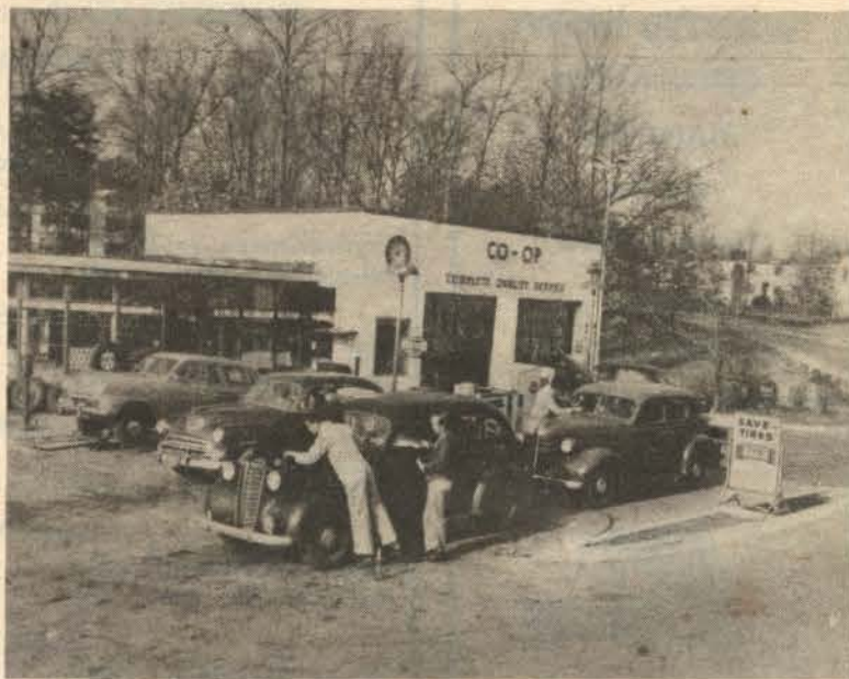
The more things change . . . The Co-op Service Station which operated between 1937 and 1956 contrasts with the sleek, modern lines of today's station on Southway.

The Greenbelt Co-op will soon face another competitor. Memco is expected to open in the area soon. Can the Co-op store with the 'personal touch' survive another blow? Or will its special attention to consumers' needs differentiate it in the minds of shoppers and continue to draw on and extend their support?