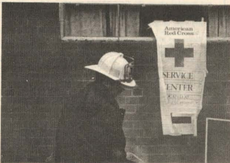
Red Cross sign, shown in photo above, directed fire victims to their relief center set up in the council chambers at the Municipal Building.

Barringer also called for a supply truck and coffee was provided.