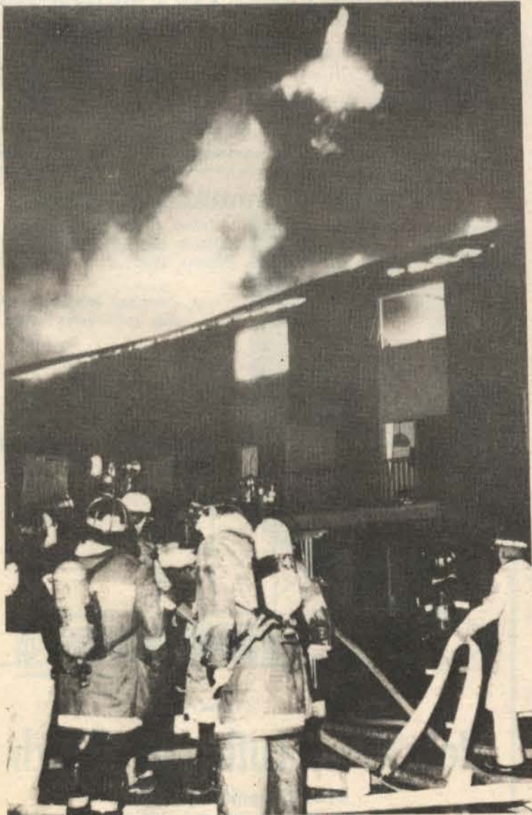
Flames that lit up the sky above the apartment at 11 Parkway could be seen from miles around. About 50 firemen worked over an hour to bring the fire under control early Sunday morning, January 31.