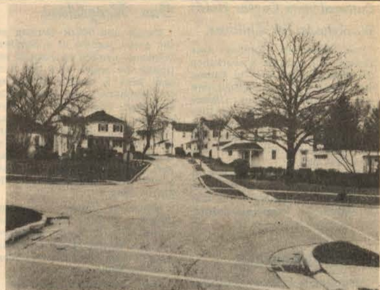
Free standing homes line a typical, narrow street in the original portion of Greendale, Wisconsin. Fifty percent of the housing in this planned community consisted of these two-story units. They are almost square with what used to be a wall storage room protruding on one side. The houses now sell for $50,000 and more.

Pfc. Watkins spoke with the Beltway Plaza Merchants in reference to reporting procedures when a robbery does occur.