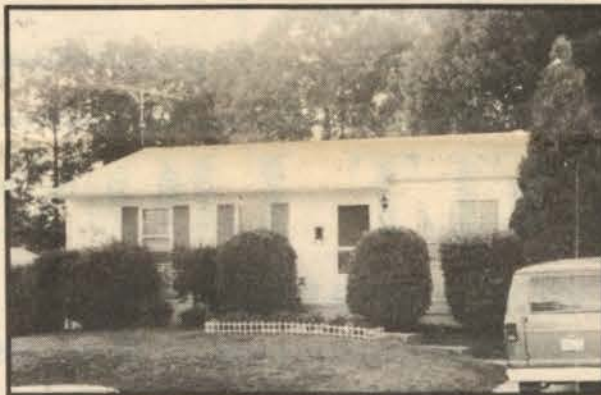
FINE LOOKING RAMBLER —Three bedrooms, 1½ baths, wall-to-wall carpet, washer, dryer, full basement and level fenced yard. Offered on all terms in the mid $50s. Call 345-2151.