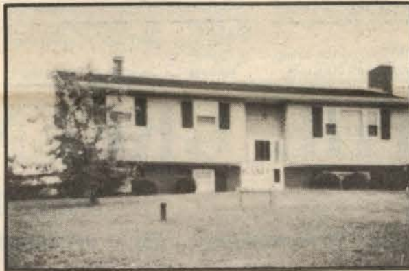
200 YARDS FROM WATER —Four bedroom, 2½ bath split-foyer home, featuring fireplace in L-shaped rec room, central air conditioning, formal dining room, carpet throughout, plus over ½-acre lot. Seven years young. $76,500. MLS 84388.