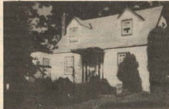
MOTHER-IN-LAW APT: 3 bedrms, 3 full baths, fireplace in liv. rm., large den and full basement. VA appraised at a real bargain of $59,950. Call 345-2151.

KASH, REALTOR is in need of homes to advertise in this magazine. If you own a home in one of the below listed areas; and you're contemplating a housing change. Give one of our experienced real estate agents a call for a free market analysis of your property. 345-2151.