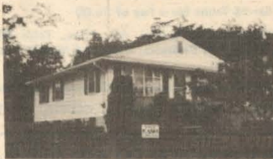
BELTSVILLE - SPACIOUS 4 bedroom rambler, full basement, rec-room & den; cent A/C. All terms in mid 60's. Hurry Just listed.