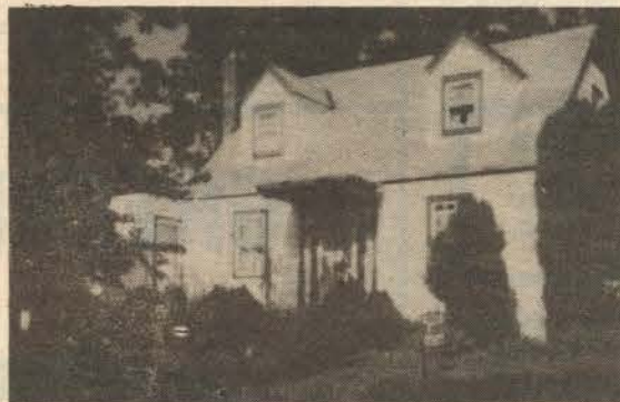
MOTHER-IN-LAW APT: 3 bedrms, 3 full baths, fireplace in liv. rm., large den and full basement. VA appraised at a real bargain of $59,950. Call 345-2151.

KASH, REALTOR is in need of homes to advertise in this magazine. If you own a home in one of the below listed areas; and you're contemplating a housing change. Give one of our experienced real estate agents a call for a free market analysis of your property. 345-2151.