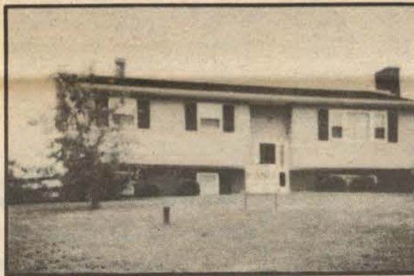
200 YARDS FROM WATER —Four bedroom, 2½ bath split-foyer home, featuring fireplace in L-shaped rec room, central air conditioning, formal dining room, carpet throughout, plus over ½-acre lot. Seven years young. $76,500. MLS 84388.