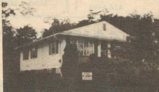
BELTSVILLE — SPACIOUS 4 bedroom rambler, full basement, rec-room & den; cent A/C. All terms in mid 60's. Hurry Just listed.