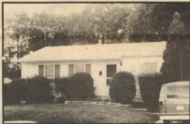
FINE LOOKING RAMBLER —Three bedrooms, 1½ baths, wall-to-wall carpet, washer, dryer, full basement and level fenced yard. Offered on all terms in the mid $50s. Call 345-2151.