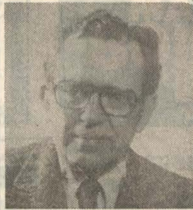
by authority of candidate

Candidate for Re-Election GHI Audit Committee