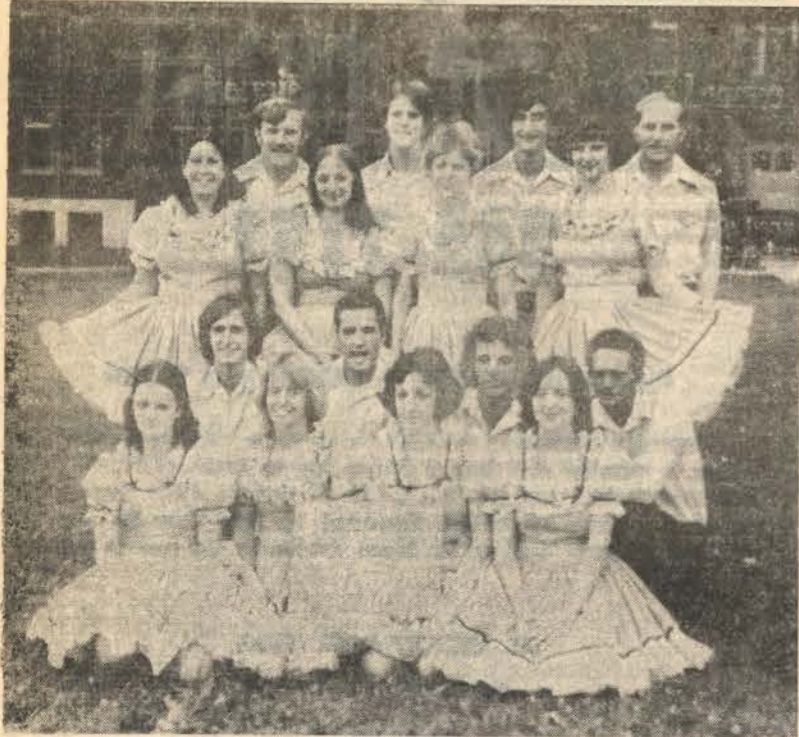
Look for the Ralph Case Square Dancers on Sunday night, Sept. 4, on the festival stage for some down-home, foot-stomping fun.