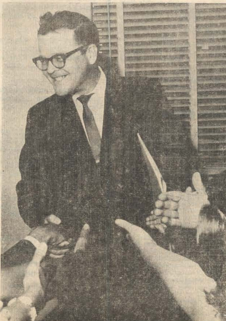
Former Mayor Edgar L. Smith striking a responsive pose during an election campaign. (1966).

The family requests that in lieu of flowers expressions of sympathy be sent to the American Cancer Society, Prince Georges County Unit, 6525 Belcrest Rd., Hyattsville.