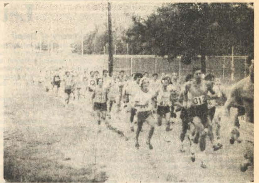
A record-breaking 315 runners and joggers line up in a mass start at Braden Field in the 1 1/4 and 15 kilometer races as part of the 1976 Labor Day Festival.

Licensed, Have References. P.S. come see my addition at 4 Empire Pl. in Lakewood!