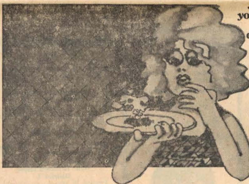
Just because you've stopped cooking doesn't mean the roast has.