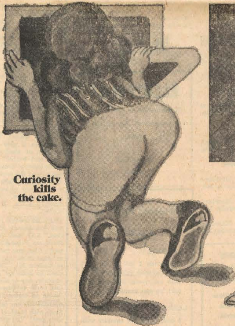
Curiosity kills the cake.